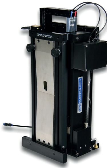
APS 113-AB with APS 0162 vertical mounting kit

APS 0162 - VERTICAL MOUNTING KIT - permits vertical orientation of the shaker, either free-standing or rigid bench attachment.